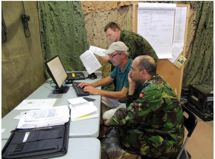
The JALLC analysis team reviews interview notes at the JTF HQ in Minorca during Exercise TRIDENT JAGUAR 14

The Final Report was released in January 2014, along with a set of working-level summary sheets, the latter being intended to support JWC in the further development and refinement of future SKOLKAN materials.