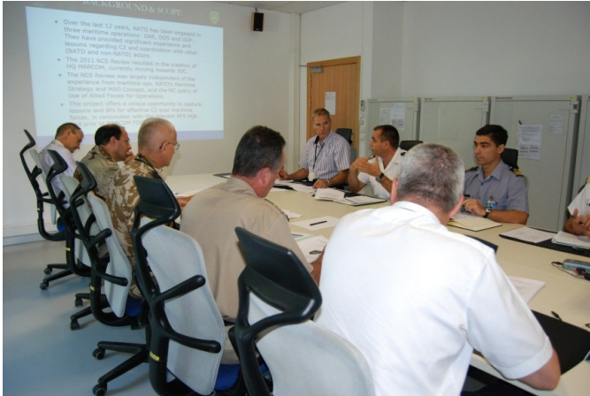
A Project Management Board for the Maritime C2 Team. Such boards are an important part of JALLC's formal project management approach, where the quality of interim products is assured and the command group gives formal approve to proceed to the next project stage.

The report has garnered positive feedback from key NATO maritime stakeholders and promises to offer valuable insights for Joint Force Commands, High Readiness Forces (Maritime) and other Single Service Commands.