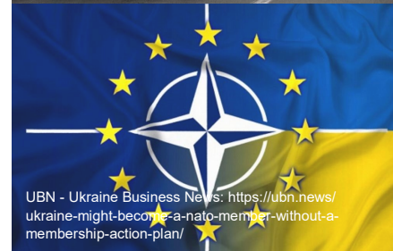
UBN - Ukraine Business News: https://ubn.news/ukraine-might-become-a-nato-member-without-a-membership-action-plan/