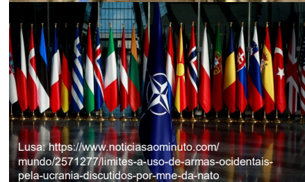
Lusa: https://www.noticiasao minuto.com/mundo/2571277/limites-a-uso-de-armas-ocidentais-pela-ucrania-discutidos-por-mne-da-nato