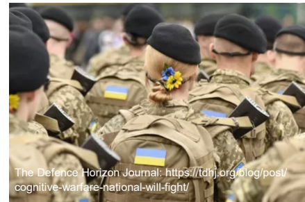
The Defence Horizon Journal: https://tdhj.org/blog/post/cognitive-warfare-national-will-fight/

You can subscribe to this newsletter by clicking HERE , or sending an email to ukr.initiative@jallc.nato.int