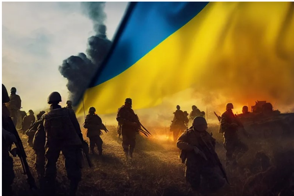
©neirfy/Adobe Stock from the article: https://epthinktank.eu/2023/03/17/the-latest-on-russias-war-on-ukraine-what-think-tanks-are-thinking-2/

The JALLC has delivered three analysis reports on Russia's war against Ukraine representing a body of work that references both open source material and NATO information such as NLLP items and reports from various NATO entities