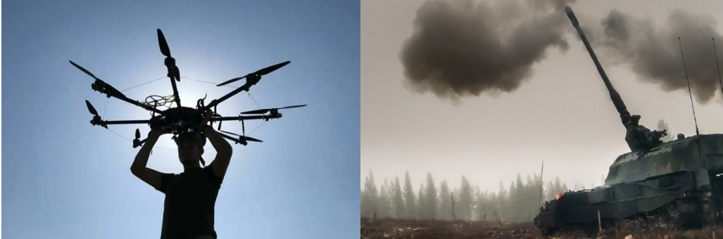
Left: New Scientist: Drone pilots defending Ukraine ( https://www.newscientist.com/article/2307922-meet-the-amateur-drone-pilots-defending-ukraines-border-with-russia/ ). Right: HCSS ( https://hcss.nl/report/lessons-from-land-warfare-one-year-of-war-in-ukraine/ )

The final report in the JALLC's 2023 Ukraine series was completed in December and contains a number of observations extracted from publications provided by a range of sources including from NATO Nations, NATO HQs, and again, from open-source material.