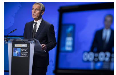
A well-timed strategic communication can be effective in efforts to deter a potential adversary.

The complex nature of Joint Fires as a multi-disciplinary function meant that extensive research was required to fully understand the scope and meaning of the diverse terminology used throughout NATO, its Allies, and Partners. Clear and standardized terminology is critical to all of NATO's activities and, as such, the Project Team focussed on this area to identify how the relevant terms were used and understood within the Alliance. Then the Project Team were able to distil and propose four basic interpretations of fires, which depend on how a person perceives the related terminology (see figure below).