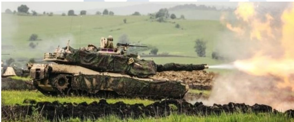
There are diverging views as to what encompasses the term Fires; the different perspectives include everything from traditional gun fire to strategic communications.

“Most practitioners agree on the following: fires are actions, effect is change, and targeting is process.”