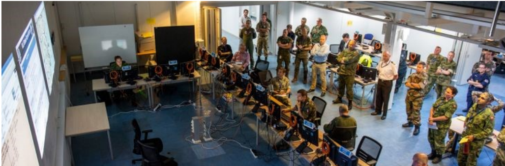
NATO media teams provide the backbone for a complex and ever changing information battle space, covering all aspects of the conflict (picture source: the Joint Warfare Centre).

The relationship between the key areas of Joint Fires, Joint Effects, and Joint Targeting (the process of carefully selecting targets in the context of a particular mission) was also analysed in order to understand how related current and future key documents might need to work together to ensure NATO has the best possible framework for an effective and efficient Joint Fires function for the Alliance.