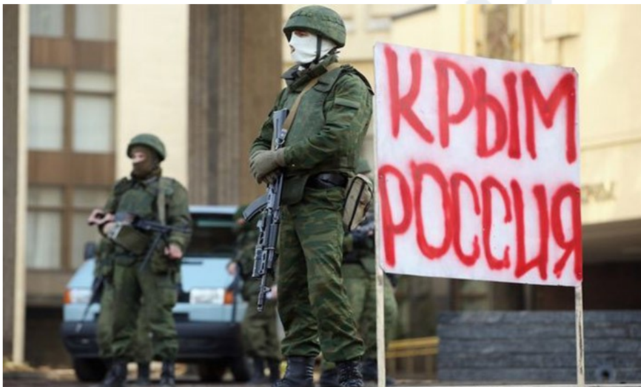
Unidentified uniformed man in Crimea

“NATO is ready, upon Council decision, to assist an Ally at any stage of a hybrid campaign. In cases of hybrid warfare, the Council could decide to invoke Article 5 of the Washington Treaty, as in the case of armed attack”