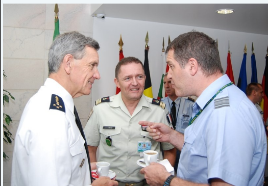
SACT visits with JALLC staff after being presented with the Decade of Conflict Report.

NATO has probably faced greater change in the last decade than it did in its previous 50+ years of existence. For example, the number of Allies in the Alliance has increased by nearly 50%, the NATO Response Force (NRF) has been created, and the NATO Command Structure radically restructured. All of this change has happened in an environment of falling defence budgets, meaning NATO really has had to do more with less.