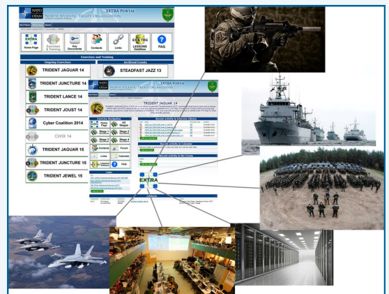
The NATO EXTRA Portal is the single centralized exercises and training related information sharing platform within NATO

The NATO EXTRA Portal is designed as a one-stop-shop for exercises and training related information and is divided over two levels: Level One covers general information and Level Two covers Exercises and Training related information.