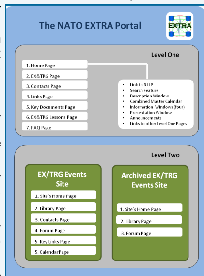
The structure of the NATO EXTRA Portal

Finally, the NATO EXTRA Portal was subjected to internal and external review and testing in two stages: Test 1 examined whether the constructed NATO EXTRA Portal worked as it was designed; and Test 2 elicited feedback from initial—and potential future—users in order to further refine the NATO EXTRA Portal to meet their needs. The results of both tests were used to further develop and refine the NATO EXTRA Portal in terms of its functionality and user-friendliness.